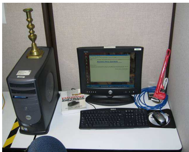
Figure 3: Lab 6 HD Analysis Setup.

The setup for the lab is shown in Figure 3. In this setup, the USB thumb drive is in the machine. Underneath the candlestick is a note which says that "I know what you two are up to, you better double check your last message again." On the computer screen is a scrolling message about Mr. Boddy and his company which starts the train of clues, and inside the computer case is a note indicating where the last message is hidden and the password to get through its encryption, the key to the encryption is found on the thumb drive in file slack. The candlestick, wrench, and the rope (CAT5 cable) are present just to keep the students guessing.